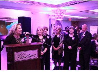
Passaic County Women's Center Purple Ball 2016 Hawthorne DVRT