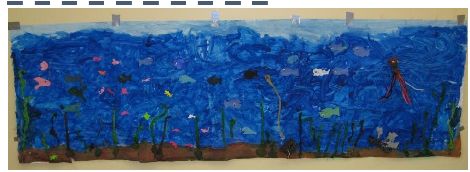
Pictured above is a project completed by PCWC PALS clients. A group of 6-7 year old boys and girls developed an ocean scene that involved multi-layered problem solving. The children tagged the underside of the fish with a feeling. When each child went "fishing", they told of a time they experienced that feeling.

80 Clients Served; 31 Caregivers, 49 Children