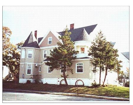
Winifred Canright House

65 Clients Received Case Management Services