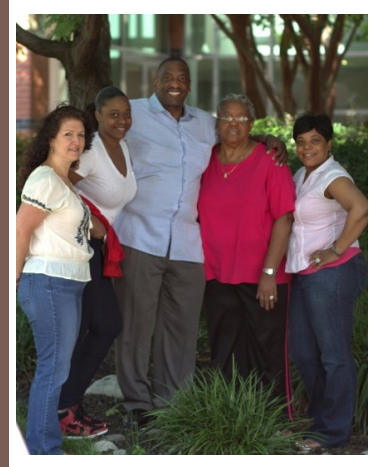
Several NJAC employees attended the Middle Atlantic States Correctional Association's (MASCA) 76th annual conference, June 11-14, in Washington DC.

On Wednesday, April 23rd, Passaic County Women's Center recognized Denim Day to promote discussions of the misconceptions that surround sexual violence. Pictured below are CCWC and PCWC staff participating in Denim Day.